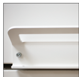
robust powdercoated housing, carrying handles