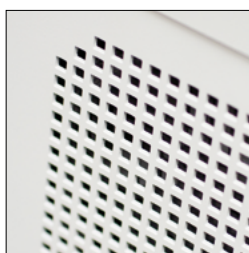
builtin thermal protection (dust protection)