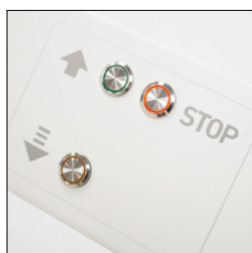
intuitive REVERSE / QUICK STOP control panel