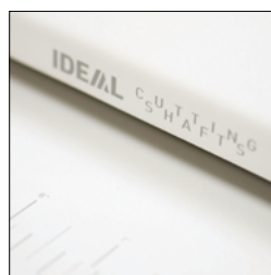
cutting section quality (Krug + Priester cutting knives)